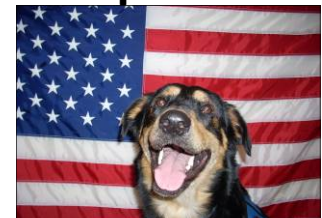
Baylee Ray Fey